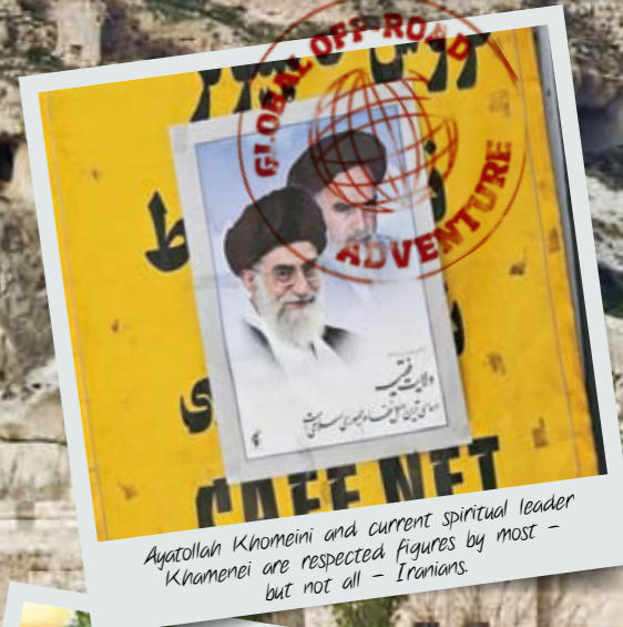
Ayatollah Khomeini and current spiritual leader Khamenei are respected figures by most - but not all - Iranians.