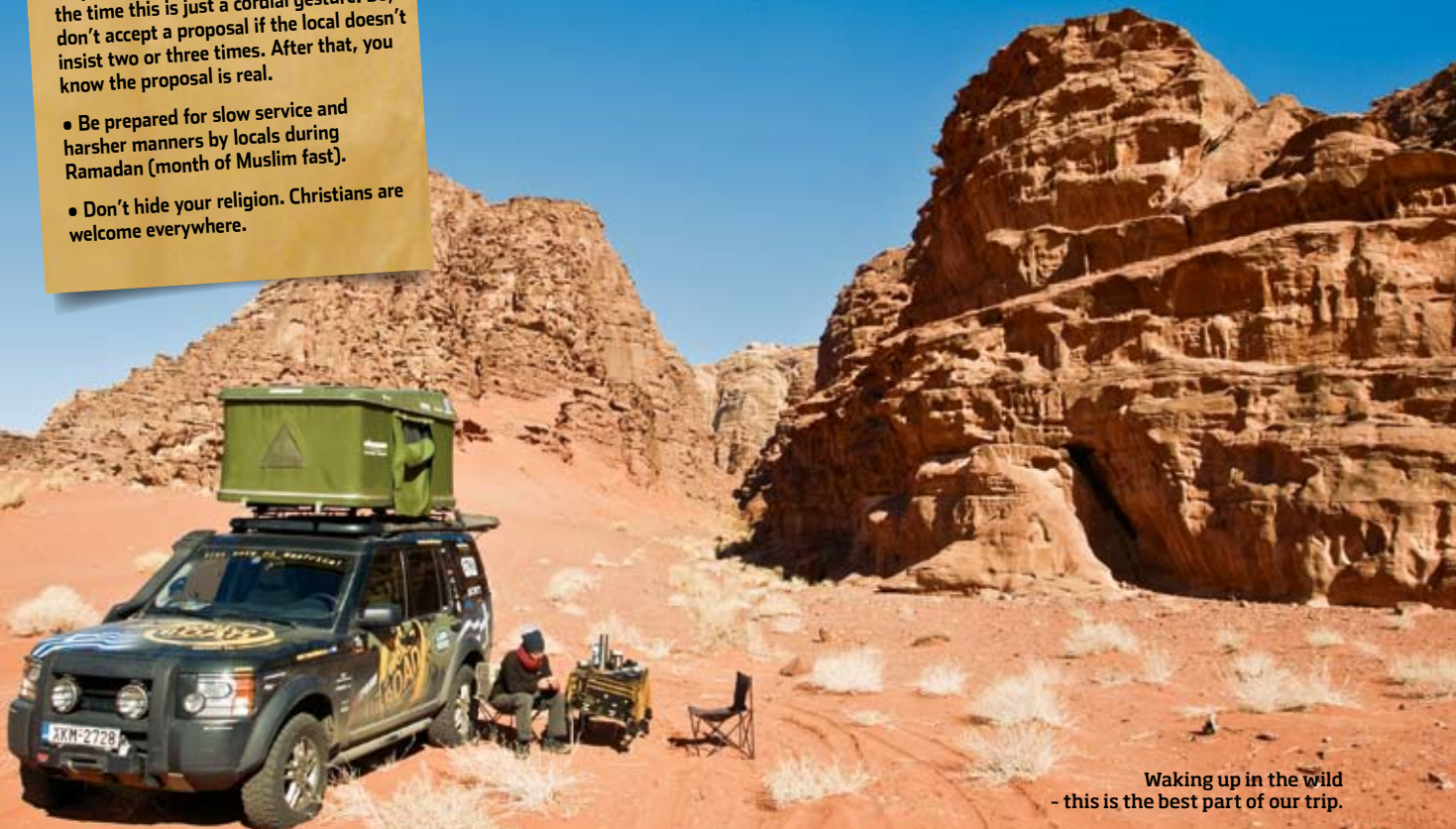
Waking up in the wild - this is the best part of our trip.