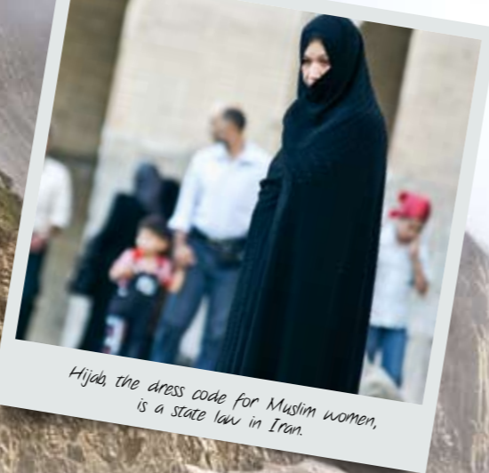
Hijab, the dress code for Muslim women, is a state law in Iran.