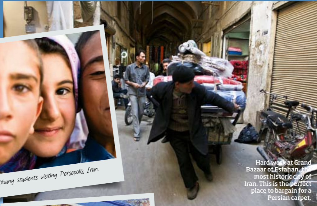
Hard work at Grand Bazaar of Esfahan, the most historic city of Iran. This is the perfect place to bargain for a Persian carpet.