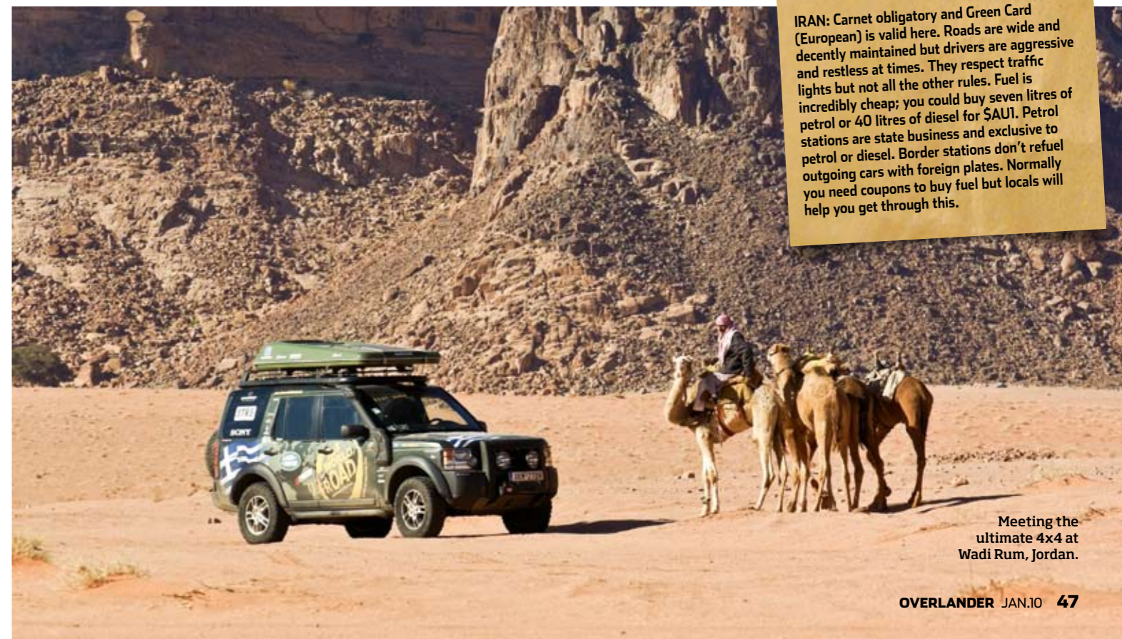
Meeting the ultimate 4x4 at Wadi Rum, Jordan.

Many people are afraid of the Middle East. They consider it a hostile environment because of the explosive politics and frequent conflicts in the area. Travelling here is not only about the excellent cuisine, the breathtaking landscapes, the vibrant markets and the historic monuments, it is mostly about people. Don't believe stereotypes about the behaviour of Muslims. We spent nearly two months in the region and we never had a negative reaction from locals. We can only recall open-hearted people. Like the Bedouin family at Wadi