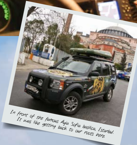
In front of the famous Ayia Sofia basilica, Istanbul. It was like getting back to our roots here.