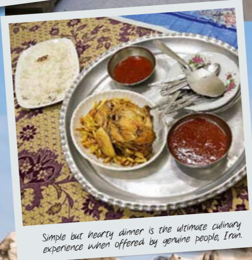
Simple but hearty dinner is the ultimate culinary experience when offered by genuine people, Iran.

Salam Alekum; "Peace be with you". Wa alekum es salam; "And upon you be peace". These are the words you learn from the moment you enter the Arabic world. Given we got there coming from Africa, Egypt seemed to be a part of the developed world for us. I remember the day we arrived in Aswan, after a 17-hour ferry trip through Lake Nasser. Everything was so different compared to Wadi Halfa, the dusty, remote town of Sudan in the Nubian desert. Egyptian roads are tarred, buildings are modern, people live in