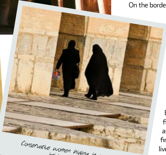
Conservative women hiding in one of the bridges of Esfahan.

Rum who offered us breakfast in the desert. Or the Syrian biker who escorted us through the hectic traffic of Damascus and found us a cheap hotel, after he offered us hot konafah (a delicious fried dessert with ricotta cheese) on the road. Another Syrian, of Armenian origins, in Aleppo left his company and spent half a day just to find a local workshop where they could clean our diesel filter. In Turkey, we were welcomed enthusiastically, especially when they realised we were 'Yunani' - Greeks. We were offered free kebabs or coffee more than once and one night, the mayor of Ulalar in Anatolia, arranged for us to camp safely in the municipal garage. We realised that we were positively discriminated despite the chronic political issues between Turkey and Greece.