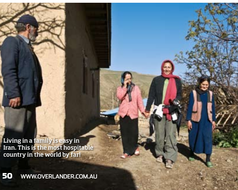
Living in a family is easy in Iran. This is the most hospitable country in the world by far!

Next month... It's time for the ultimate cultural shock as the couple cross Pakistan and enter India.