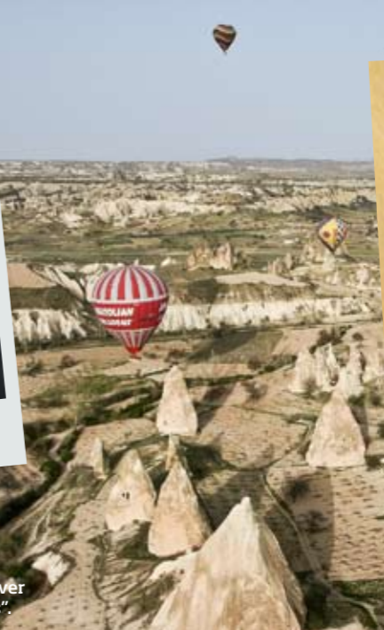
Don't miss a balloon flight over Cappadocia "fairy chimneys".