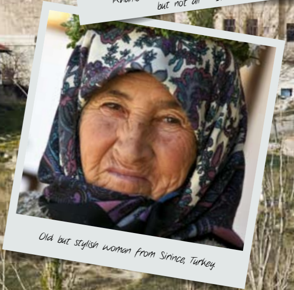
Old but stylish woman from Sirince, Turkey.