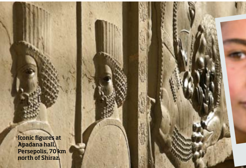
Iconic figures at Apadana hall, Persepolis, 70 km north of Shiraz.