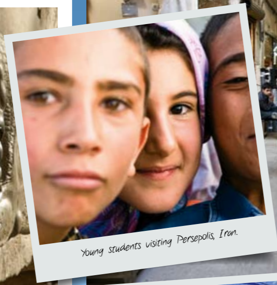
Young students visiting Persepolis, Iran.