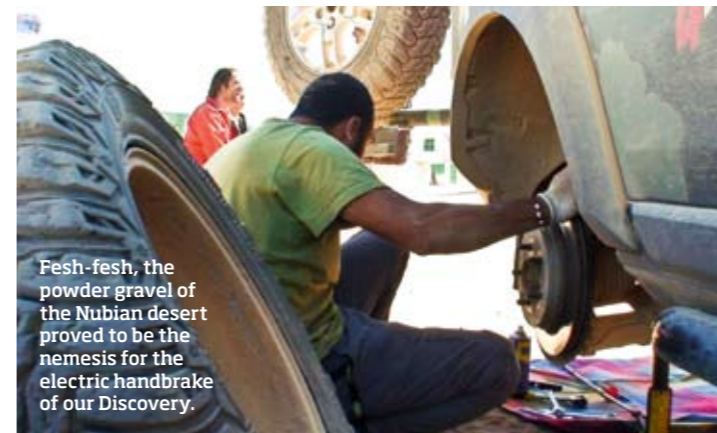
Fesh-fesh, the powder gravel of the Nubian desert proved to be the nemesis for the electric handbrake of our Discovery.

“ We were obliged to use the hill decent control system for keeping our Discovery on the road. ”