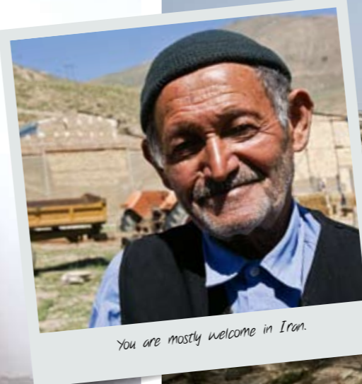
You are mostly welcome in Iran.